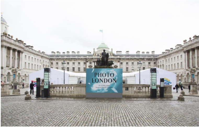
Photo London was created to give London an international photography event befitting the city's status as a global cultural capital.

The next edition of the Fair will take place 18-21 May 2017.