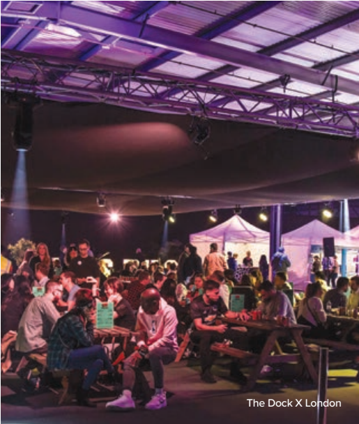
The Dock X London

Host your event in one of London's most famous museums with Illuminate. Located on levels 4 and 5 of the Science Museum, Illuminate opened in February 2019. The space, which is available for hire both during the day and the evening, offers a bright setting, thanks to its panoramic window of level 5, and has a capacity of up to 450. The Science Museum provides planners with bespoke packages thanks to its collaboration with Movie Venue and White Light, the catering and AV partners.