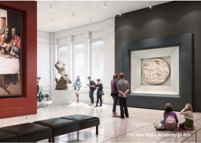
The New Royal Academy of Arts