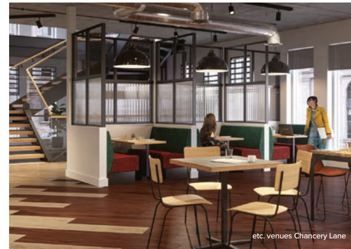
etc. venues Chancery Lane

The new etc.venues 133 Houndsditch offers 33,000 sq ft of event space across one easy-to-use floor and our largest room for 700 theatre or 500 cabaret.