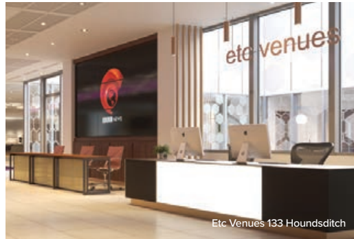
Etc Venues 133 Houndsditch

The National Gallery is one of the most visited and best loved art galleries in the world, housing works by artists including Van Gogh and Titian. Adding to the great range of event spaces on offer, these two new outdoor areas will be ideal for drinks receptions in the sunnier days of summer, with the garden providing a peaceful oasis away from the hustle and bustle of city life.