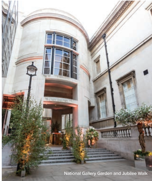
National Gallery Garden and Jubilee Walk

London's unrivalled range of venues makes it one of the best destinations to host an event.