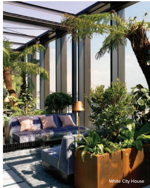
White City House

From global hotel chains, luxurious five star hotels and budget conscious value brands to independent boutique properties, London's wealth of accommodation constantly evolves.