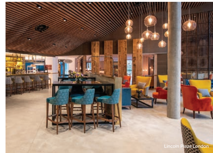
Lincoln Plaza London

Edwardian Hotels London is transforming the London Hospitality sector with the opening of the world's first Super Boutique hotel, The Londoner, in Spring 2020. Located in London's legendary Leicester Square, this 15 storey hotel is boutique in feeling, yet staggering in scale. With 350 luxury bedrooms, six concept eateries and a variety of bespoke event and meeting spaces - including a state-of-the-art ballroom accommodating up to 864 guests - alongside a spa and wellness centre and two Odeon cinemas, this hotel promises exceptional customer service and class.