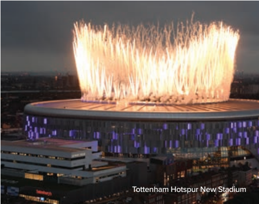
Tottenham Hotspur New Stadium

Tottenham Hotspur is one of the most famous football teams in the world. Discover its new stadium, which is also a home to the NFL in the UK. With more than 62,000 seats, it is a grand addition to London's stadia and has plenty to offer to event planners. Fit for small and large-scale events with a capacity of up to 1,500, you're sure to impress your delegates with an event overlooking the pitch.