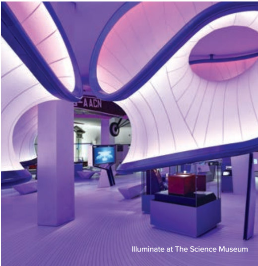
Illuminate at The Science Museum

The venue can comfortably accommodate up to 1,500 people.