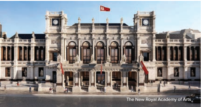
The New Royal Academy of Arts