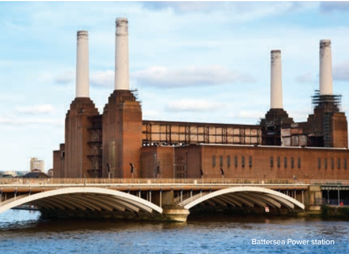
Battersea Power station

This iconic Grade II*-listed building and its surrounding area are being brought back to life as one of the most exciting developments in London. The new complex, which has already welcome a number of openings, features a mix of residential spaces, shops, restaurants and bars. London's first art'otel is expected to open in the Station in 2022. Battersea Power Station will also benefit from two new Tube stations in the Nine Elms area which are due to open in 2020.